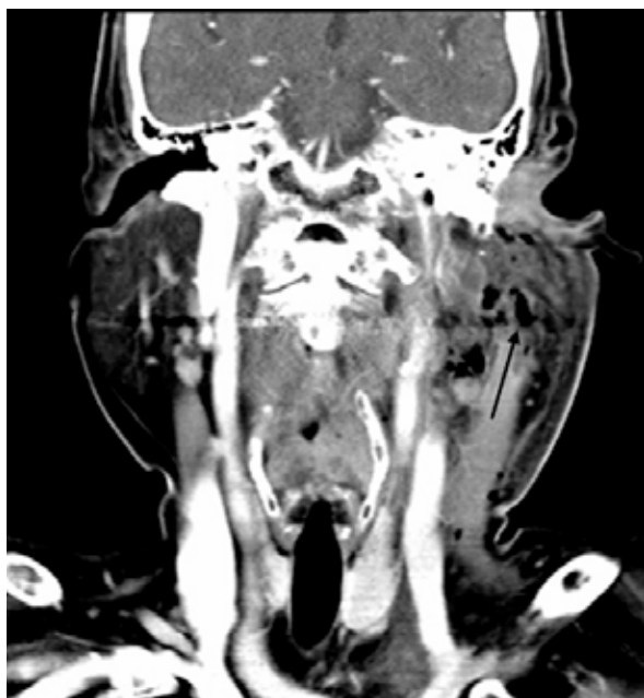
Figure 1: Coronal CT scan of a patient diagnosed with left mastoid abscess and Bezold's abscess (arrow)