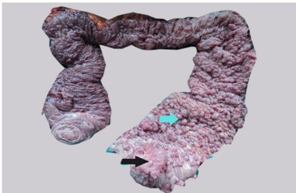
Figure 3: Specimen showing an ulceroproliferative lesion (black arrow) and multiple polyps (green arrow).