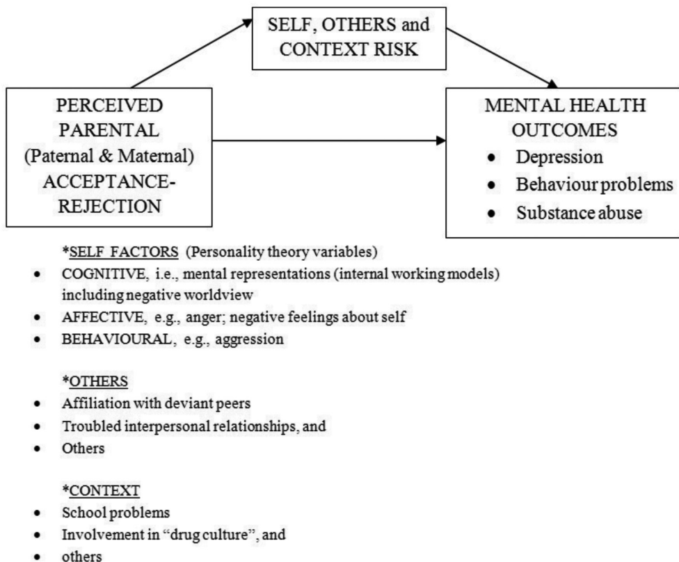
Fig.1: Mediation model of the relationship between parental (paternal and maternal) acceptance-rejection and mental health outcomes.

In relation to the warmth dimension of parenting, past research often examined various aspects or dimensions of parenting in explaining adolescent's outcome. The dimensions are often divided into two; parental support and control (Bean, Barber, & Crane, 2006), parental acceptance and