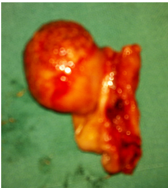
Figure 3: Ileal polyp (resected specimen).