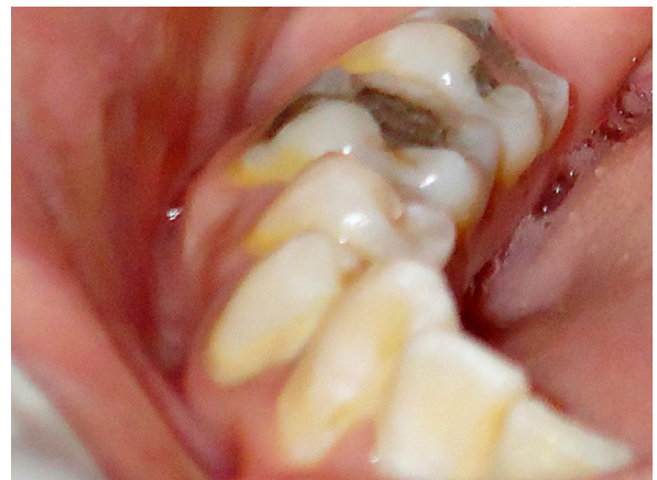
Figure 1: Intraoral photograph of silver amalgam filling i.r.t #46, 47.

On examination, a silver amalgam restoration of the permanent mandibular right first molar (FDI #46) was noticed, which was tender on percussion (Figure 1). On pulp vitality testing, an exaggerated pain response was produced and a provisional diagnosis of irreversible pulpitis was