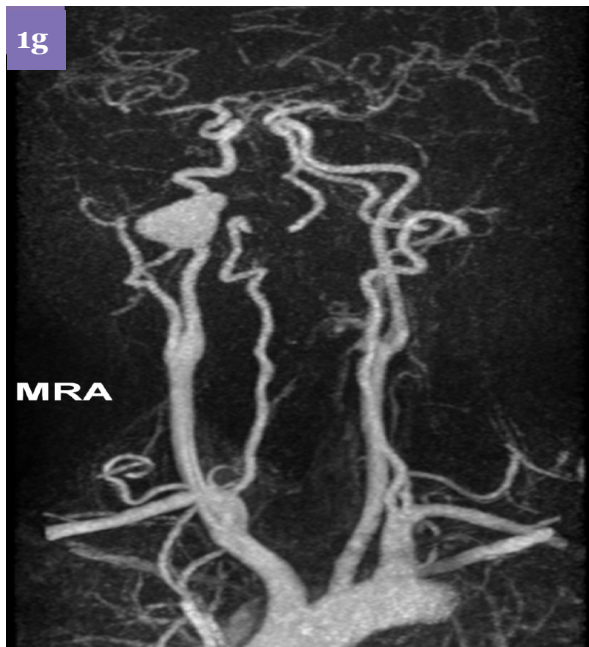
Figure 1g: Magnetic resonance angiography demonstrates a pseudoaneurysm involving the cervical portion of right ICA.