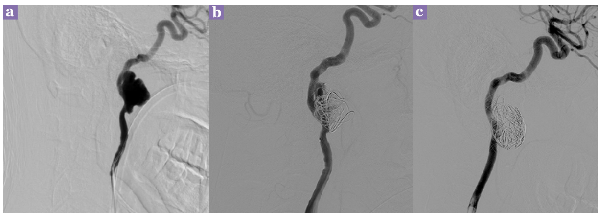
Figure 3: (a) Lateral view of DSA demonstrated right cervical portion ICA pseudoaneurysm with wide neck; (b) Post-stenting and coiling angiogram showed good patency of the right ICA with improved flow intracranially. Partial thrombosis of the pseudoaneurysm was evidence; and (c) Repeat DSA one year post-stenting and embolization revealed minimal residual aneurysm.

Conservative treatment with anticoagulants and antiplatelets can be considered for a young patient without symptoms (4). However, in many