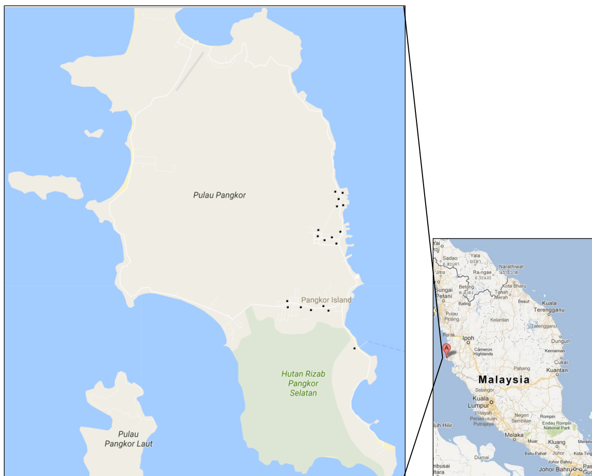
Figure 2: Location 18 Households for domestic waste segregation sampling