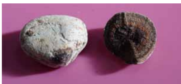
Figure 3: Mixed gallstone.

Cholesterol was present in 38 (82.6%) stones; it was more frequent in females ( n = 24 , 63.2%, 95% CI 46.0–78.2) than in males ( P < 0.001 ). The incidence of bilirubin-containing stones ( n = 12 , 26.1%) was slightly higher in males ( n = 7 , 58.3%) than in females ( n = 5 , 41.7%). However, this was not statistically significant ( P = 0.240 ). The triglycerides were seen only in cholesterol and bilirubin mixed calculi.