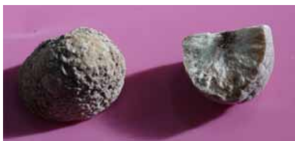
Figure 2: Cholesterol gallstone.