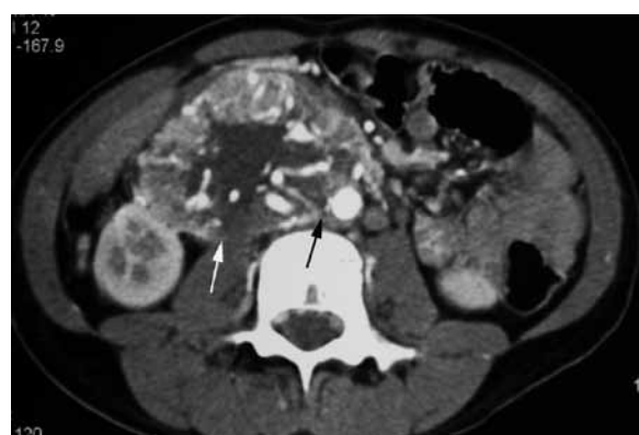
Figure 2: Abdominal computed tomography scan that was done at the time the child presented with gastrointestinal bleed shows a large heterogeneous inferior vena cava (IVC) mass, which is highly vascular with thrombus within the IVC lumen (white arrow). There is no clear fat plane between the mass and aorta (black arrow).

The child underwent laparotomy 1 day after the embolisation. Intra-operative findings showed an intraluminal IVC tumour that was densely adhered to the right kidney as well as the second and third part of duodenum. The right ureter was wrapped by the tumour and displaced laterally. Therefore, the whole tumour was dissected away from the aorta and resected. Right nephrectomy and resection of the second and third part of duodenum were done. Sutures closed both ends of the IVC stump. There was minimal intra-operative blood loss (less than 1 litre).