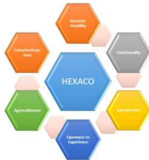
Figure 3: The HEXACO Model

The subjects were then profiled using a battery of appraisals and psychological inventories including but not limited to motivation to learn language profiles, learning styles, multiple intelligences, Myers-Briggs Type Indicators (MBTI) and HEXACO.